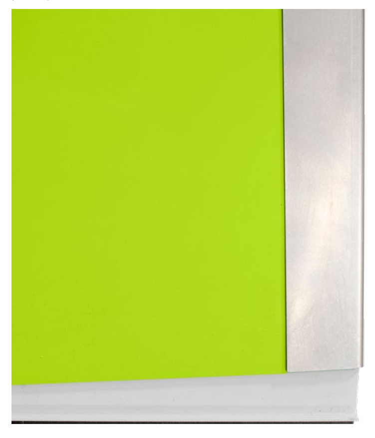
The PVC, adjustable, sealing channel with a neoprene gasket hugs the floor's slope for triple protection from cross contamination.

The Perfect Panel Design<sup>TM</sup> has an adjustable, sealing channel with a neoprene gasket that hugs the floor's slope. The channel bar uses corrosion-proof, construction-grade PVC that won't be affected by common cleaning chemicals. Aluminum, construction experts warn, is susceptible to pitting corrosion, a common cause of metal failure.