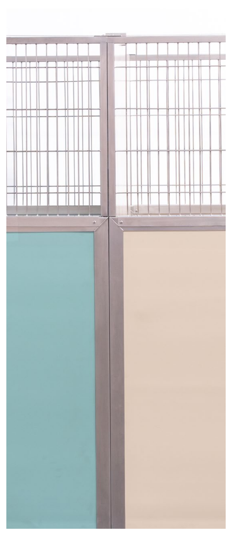
T-Core with Perfect Panel Design ^{\text{TM}} features a laminated, high-density, closed-cell foam core for insulation and superior durability.

Our durable T-Kennel side and back panels just took a giant step ahead of the field with the strongest core ever put in a pet housing panel: T-Core with Perfect Panel Design <sup>TM</sup>.