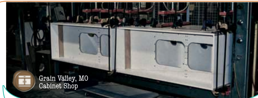
Grain Valley, MO Cabinet Shop